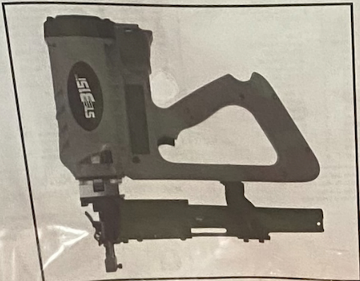
GAS POWERED, LOW VELOCITY PISTON TYPE FASTENING TOOL